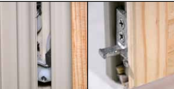
Shoe Sash Piv