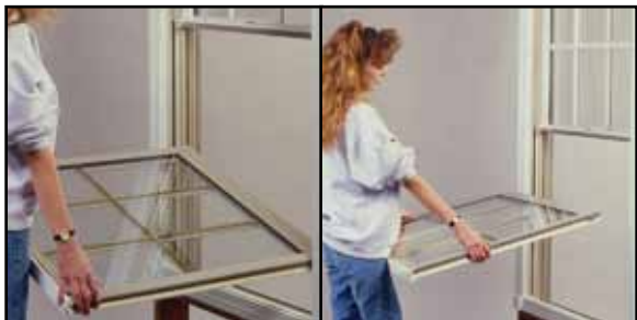
Lift up, then angle.