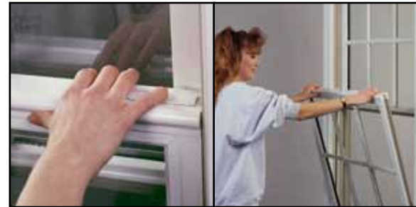
Release finger latches