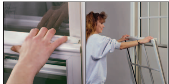
Release finger latches.