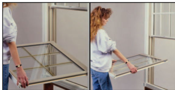
Lift up, then angle.

Note: It is very important that the sash pivot pins properly and full engage the balance shoes. The balance shoes will not work correctly if the sash pivot is not fully seated in the balance shoe. An improperly installed sash can damage the balance shoe, pivot pin and jamb liner.