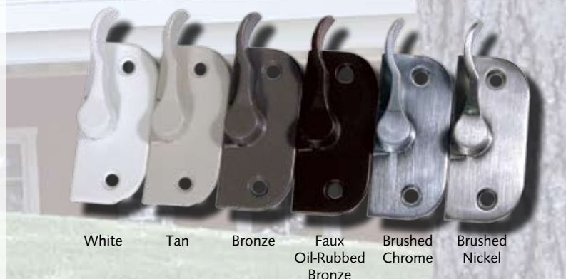
White Tan Bronze Faux Oil-Rubbed Bronze Brushed Chrome Brushed Nickel